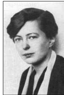
Maria Goeppert Mayer

The fact that nuclei with certain numbers of nucleons were especially stable had in fact been noticed before, but physicists were so certain that a shell model could not be correct, in part because an alternative model, the liquid drop model, which treats the nucleus as a homogeneous blob, had been quite successful in explaining fission. In